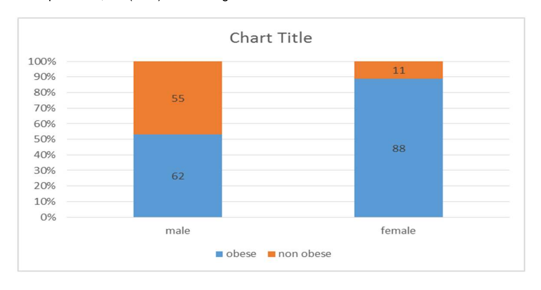
Fig. 1. Visceral obesity among respondents

The study indicated the level of knowledge of participant at a score of 4.29 from a possible score of 9 (47.67%) with a very low level of knowledge at 1.27 score from a possible 4 (31.75%) on the causes of visceral obesity. Among the respondents, 71% of the respondents had below fifty percent of knowledge regarding visceral obesity followed by 17.7% who had average knowledge and only 11.3% had good knowledge about visceral obesity (Table 4).