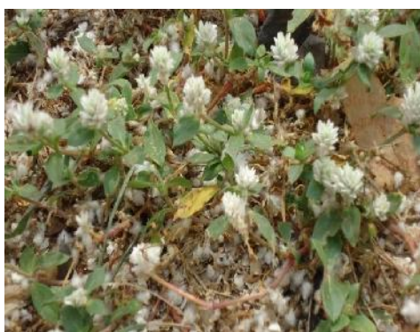
Fig. 1. Gomphrena celosioides in its natural habitat