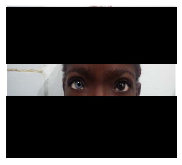
Fig. 1. Ocular appearance at presentation

Canthorum]. The Iris was hypopigmented and bluish in colour in the right eye, whilst the left Iris was brown and darkly pigmented. Fundal examination was normal. No significant refractive error was found. The disease was diagnosed based on the presence of 2 major criteria as proposed by the waardenburg consortium viz; pigmentary disturbances of the iris and dystopia canthorum.