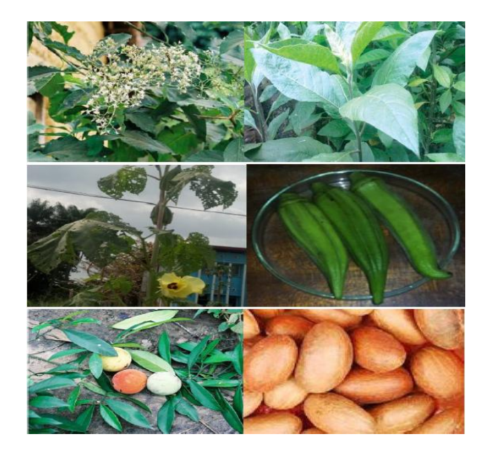
Fig. 1. Vernonia amygdalina (top), Hibiscus esculentus (middle) and Garcinia kola (bottom)

The botanical identity of the species harvested was confirmed by a botanist at the herbarium of the Faculty of Science of University of Kisangani.